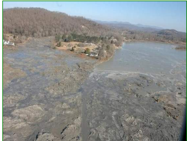
Aerial photo of the Dec. 22 coal ash spill in Tennessee

On December 22, 2008, a dike holding back decades worth of coal ash failed at the Kingston Fossil Plant in Harriman, Tenn., flooding the surrounding residential area with more than one billion gallons of toxic coal ash, or enough to flood more than 3,000 acres one foot deep. i Testing of surrounding water bodies showed extremely dangerous levels of arsenic, mercury, and other toxins. One sample showed arsenic at 149 times higher than what is considered safe. ii This is not an isolated incident. In August 2005, a dam confining a surface impoundment in Pennsylvania failed, discharging tons of coal ash water into the Delaware River. A similar failure occurred at an impoundment at Plant Bowen in Georgia in 2002.